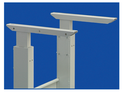
Table top support, not tiltable = basic version.