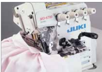
● For gathering MO-6714S-BE6-327/S162 (S162: Swing-type gathering device)