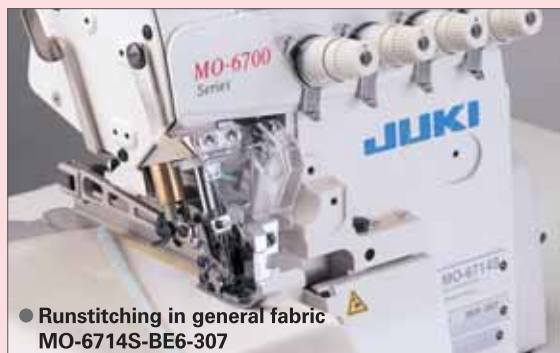
● Runstitching in general fabric MO-6714S-BE6-307

Since the machine comes with a needle-thread take-up mechanism as well as a looper thread take-up mechanism, to offer upgraded responsiveness from light- to heavy-weight materials with a lower applied tension, it achieves well-tensed soft-feeling seams that flexibly correspond to the elasticity of the material at the maximum sewing speed of 7,000sti/min.