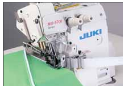
● For rolling-in tape MO-6745S-ED4-360/N077 (N077: Clean finish top and bottom)