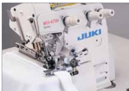
● Blind hemming MO-6705S-0E4-41H/L121 (L121: Blind stitch hemming attachment)

Diversified subclass machines are available. The selection of a machine that best matches the processes in concern are permitted.